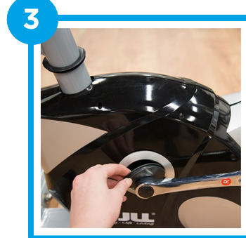
Lift up the rubber rings and take out the center rubber piece