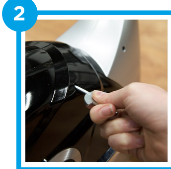
Using the multi tool remove all the screws