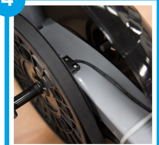
Remove either one or both sides of the casing