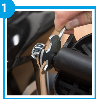
Start by removing the pedals